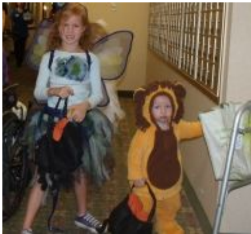
The Butterfly Queen & The Lion King