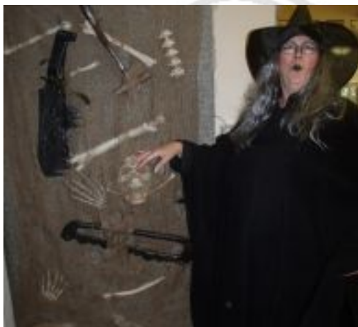
Felix the Cat & Barbara the Witch